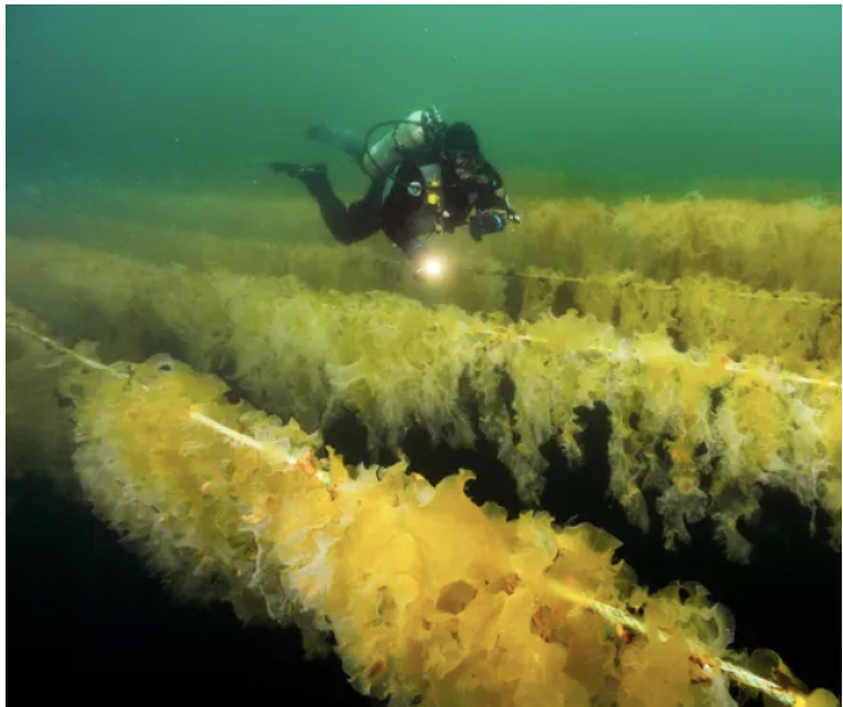
Figure 4. A Similar Aim: Scientists constructed a seaweed farm in Alaskan Waters.