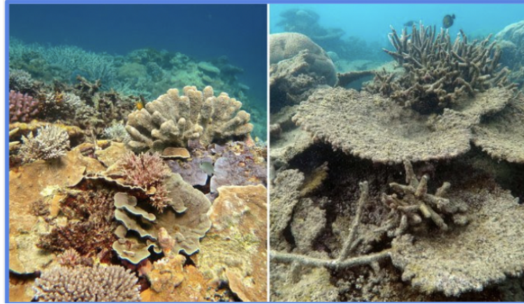
Figure 1. Representation of living coral vs dead coral.